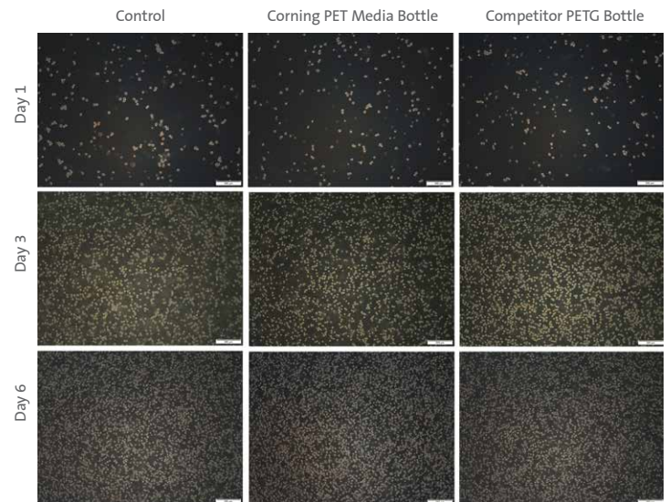
Figure 2. AE-1 cells cultured with serum that was frozen and stored in Corning PET media bottles or Competitor PETG bottles.