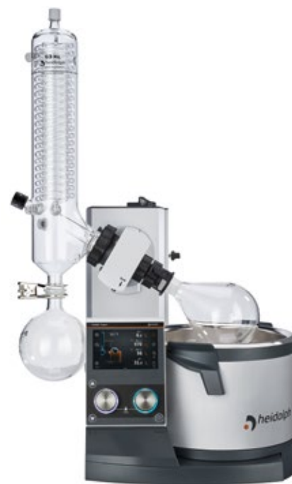
Max. evaporator flask size: 5 L

The perfect add on available with cooling capacities of 250, 350, 600 or 1,200 W.