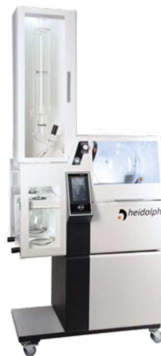
Max. evaporator flask size: 20 L

Maximum performance with systems that perfectly complement each other. Discover the Hei-CHILL models 3,000 and 5,000 W.